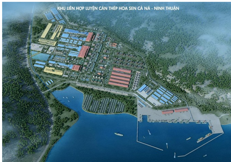
The 3D image of the Hoa Sen Cà Ná Steel plant in the south-central province of Ninh Thuận.

Viet Nam News HÀ NỘI — Prime Minister Nguyễn Xuân Phúc has halted construction of the US$10.6-billion Hoa Sen Cà Ná steel plant in south-central Ninh Thuận Province, while requiring more studies to be completed on the consumer demand and the environmental impact of the plant.